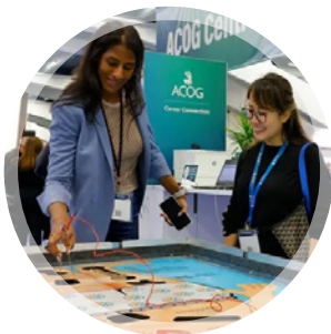
Exhibit Hall Features

73% of 2024 attendees were practicing physicians and health care providers!