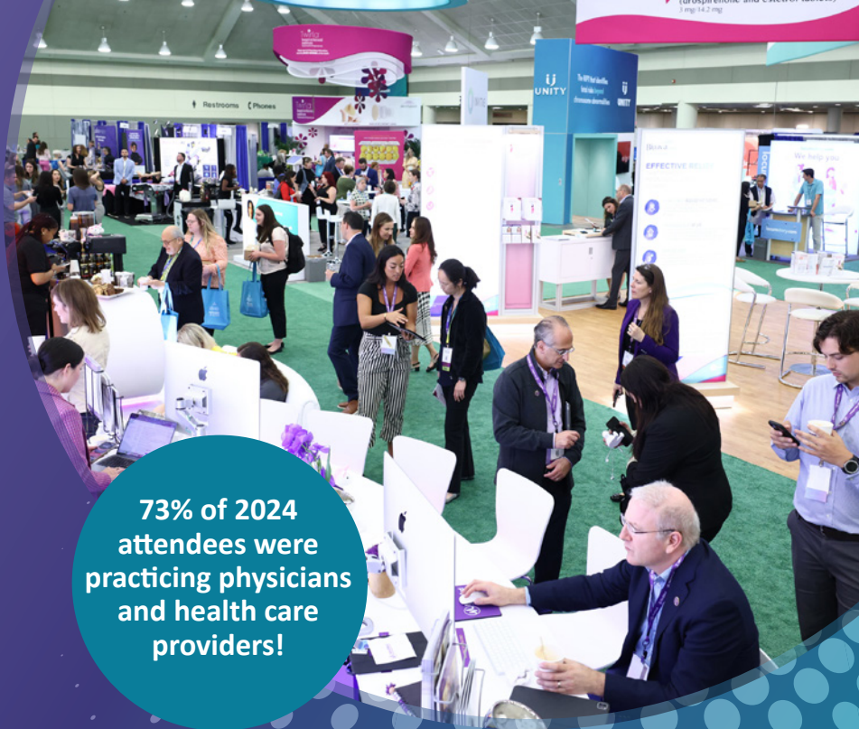
Exhibit Hall Features

73% of 2024 attendees were practicing physicians and health care providers!