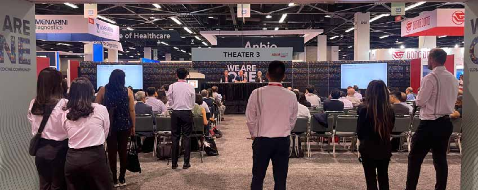
EXHIBIT HALL, CONVENTION CENTER & CITY WIDE OPPORTUNITIES