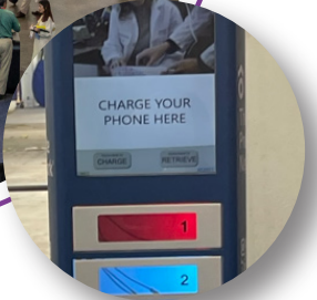
EXHIBIT HALL OPPORTUNITIES