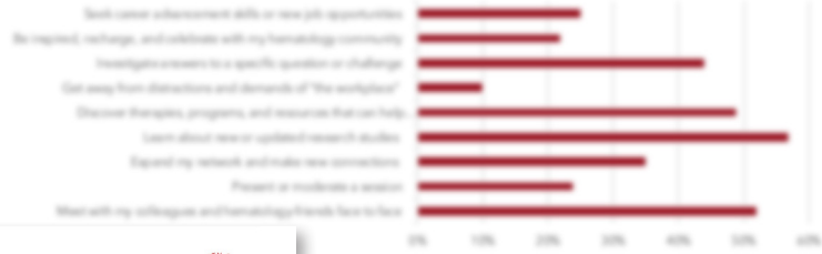
% of People Who Included The Objective in Top Three

ASH asked attendees the question: "What are your top three objectives for attending ASH annual meeting?"