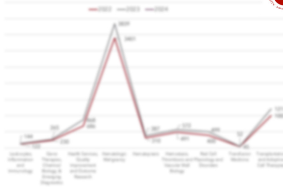
Quantity of Submissions by Science

Abstracts submitted for oral and poster presentations at the ASH annual meeting represent important, novel research in the field and are considered the best of the thousands of abstracts submitted. They are also an indicator of audience interest and focus.