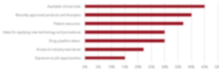
% of Attendees Who Prioritize this Objective

"What do you expect to obtain or learn from engagement with industry during the ASH annual meeting?"